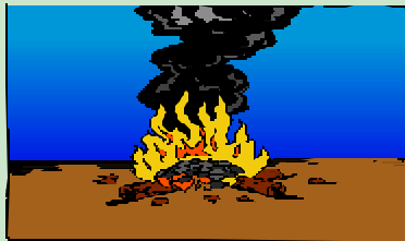
LEAVE NO FIRES UNATTENDED

FIRE DANGER RATING IN SCENIC ESTATES AND ABOVE MAY BE HIGHER THAN LOWLAND .